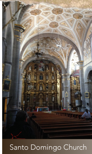
Santo Domingo Church