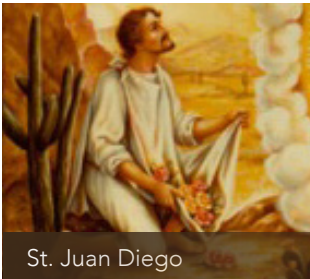
St. Juan Diego