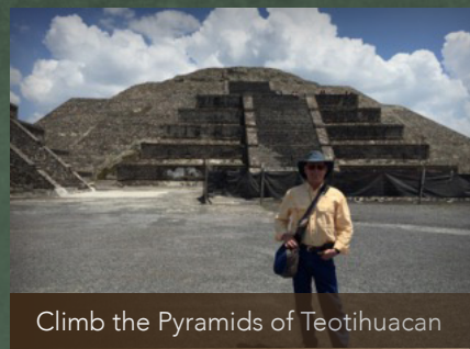
Climb the Pyramids of Teotihuacan