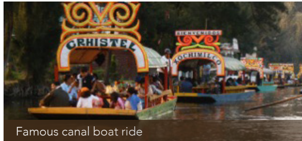
Famous canal boat ride