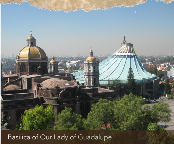
Basilica of Our Lady of Guadalupe

INVITE YOU ON A PILGRIMAGE TO DISCOVER THE